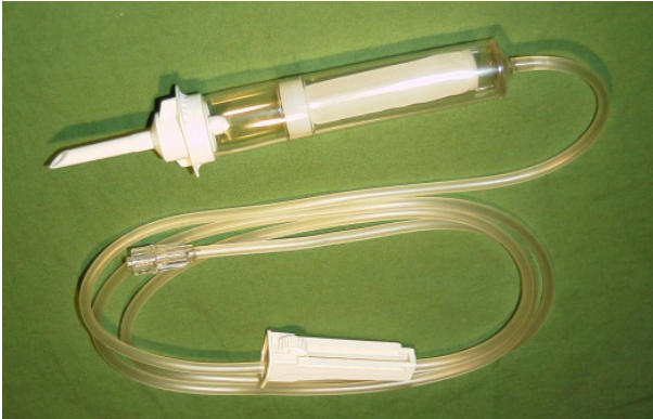
210-000 ATS-40 Transfusionset with 40µ-Filter